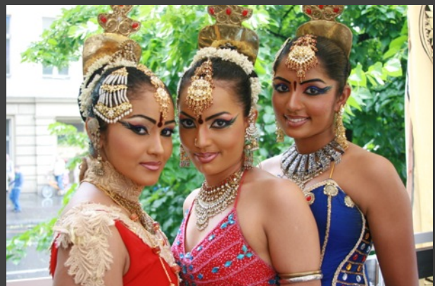
Sri Lankan Cultural Performers