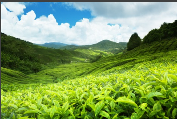
Tea Plantation Tour