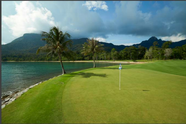
Els Club Teluk Datai - 1 round