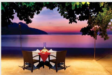
The Andaman Resort 5-Star luxury only 1.7km from Els Club Teluk Datai

The package prices advertised on the Golf Tours Abroad website are based on a range of 3-5 Star hotel accommodation in various locations on Langkawi. Hotels are subject to availability so if you'd like to enquire about single-share accommodation, additional nights, other particular hotels, additional golf or any other variations to the package, please contact Golf Tours Abroad directly. We specialise in tailoring to our customers' needs, so if you'd like to vary any part of our packages, please don't hesitate to ask.