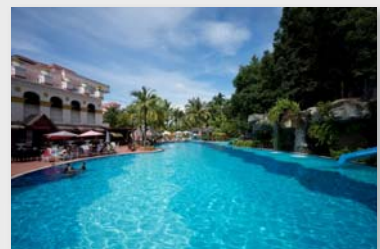
Aseania Resort a popular resort located at Pantai Tengah