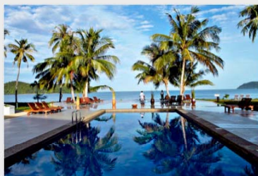
Frangipani Resort & Spa an oceanfront resort located at Pantai Tengah