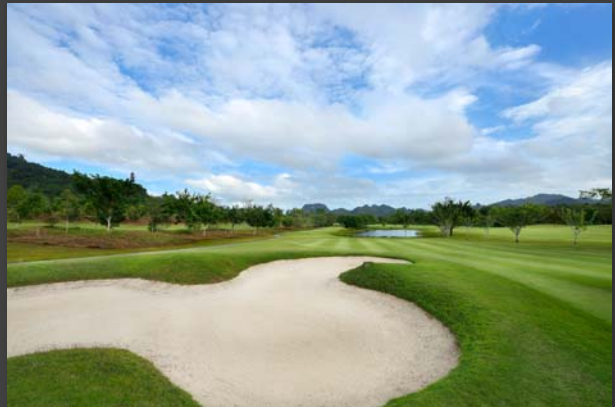
Gunung Raya - 1 round

Like all of Golf Tours Abroad's packages, we can tailor your holiday and vary many of your inclusions such as standard & type of room; number of nights and amount of golf.